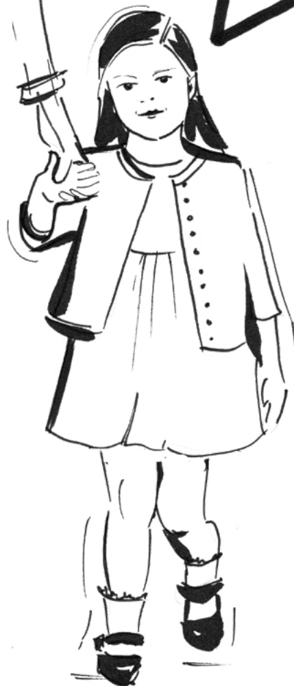
ILLUSTRATION BY JEN AND JENNIFER