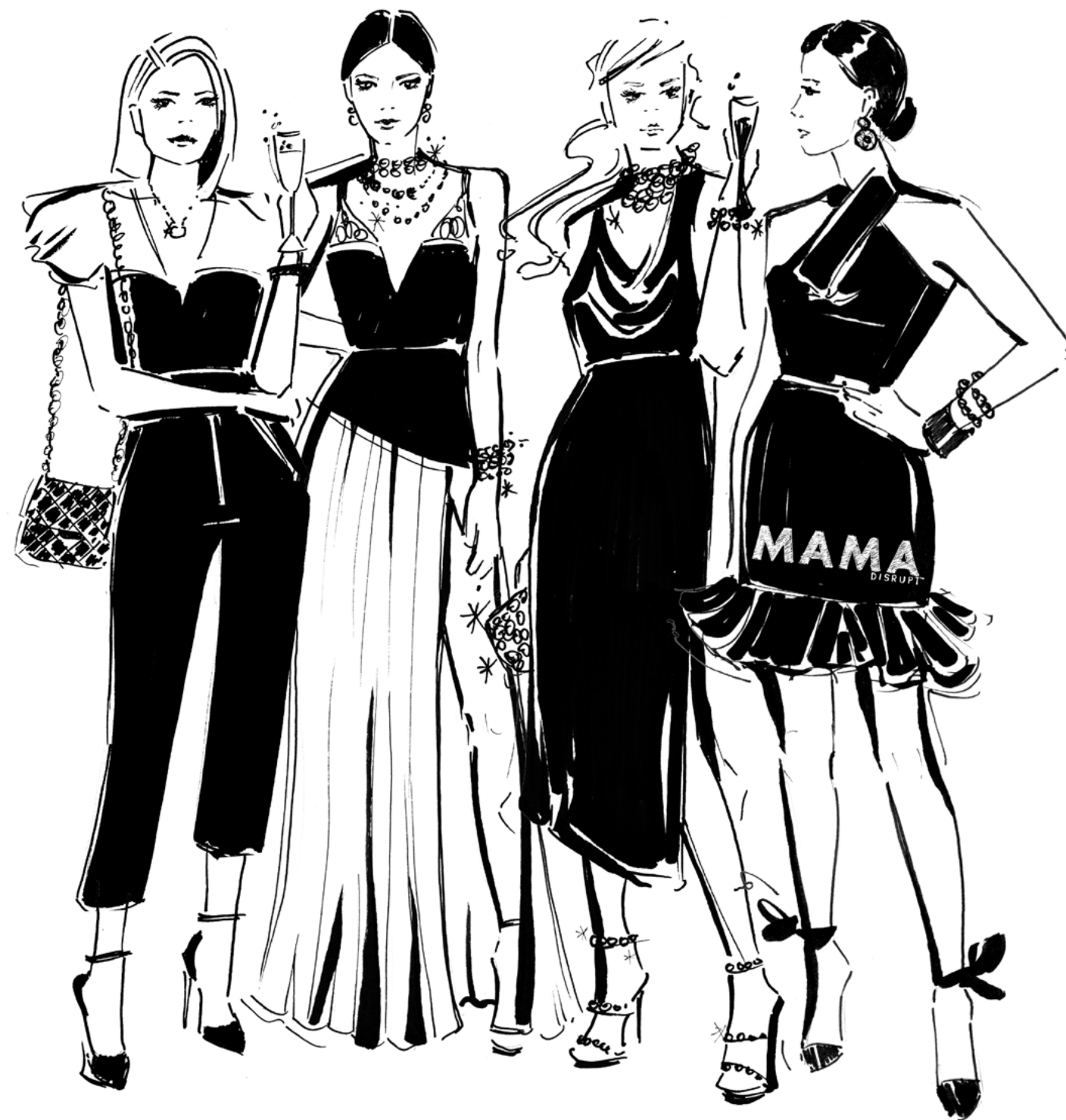
ILLUSTRATION BY JEN AND JENNIFER